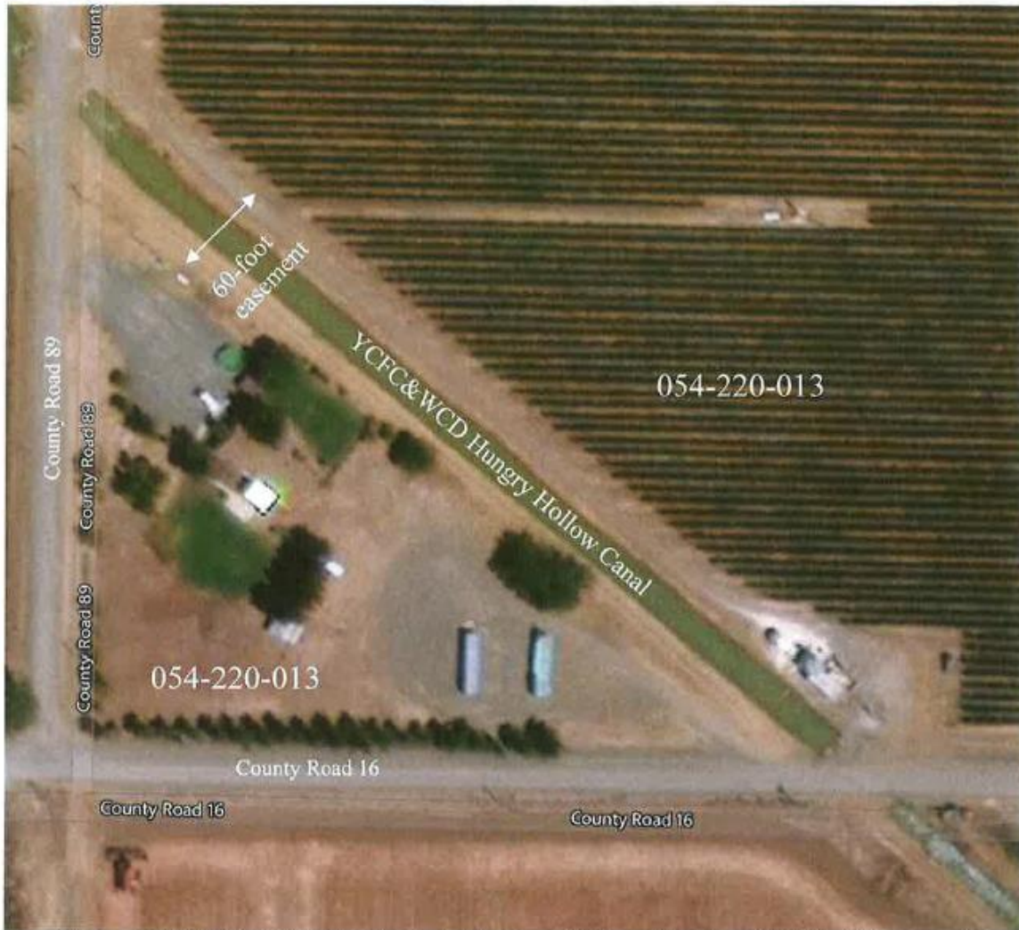
Map of APN 054-220-013, District's Hungry Hollow Canal, and 60-foot Easement